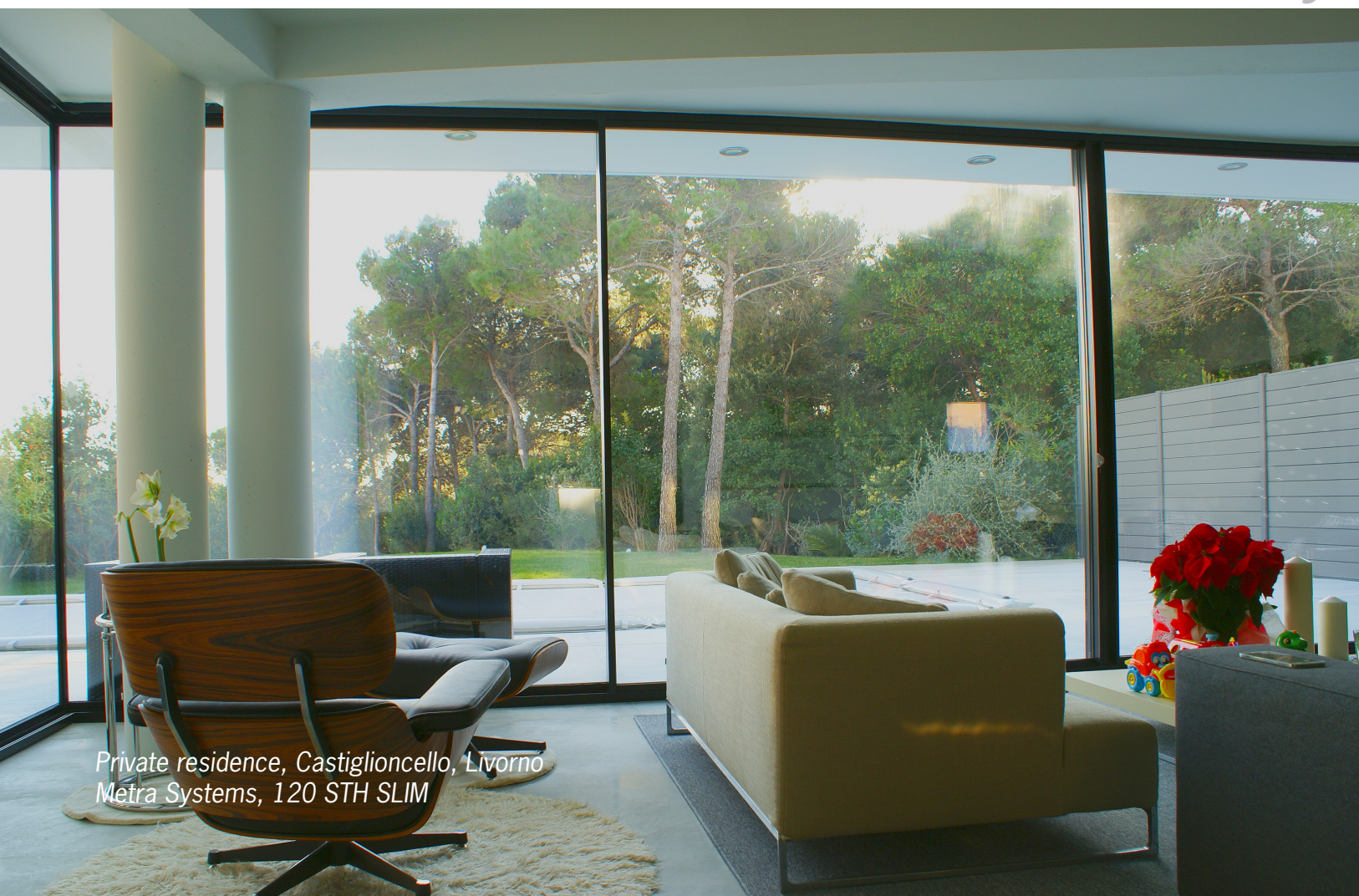
Private residence, Castiglioncello, Livorno Metra Systems, 120 STH SLIM