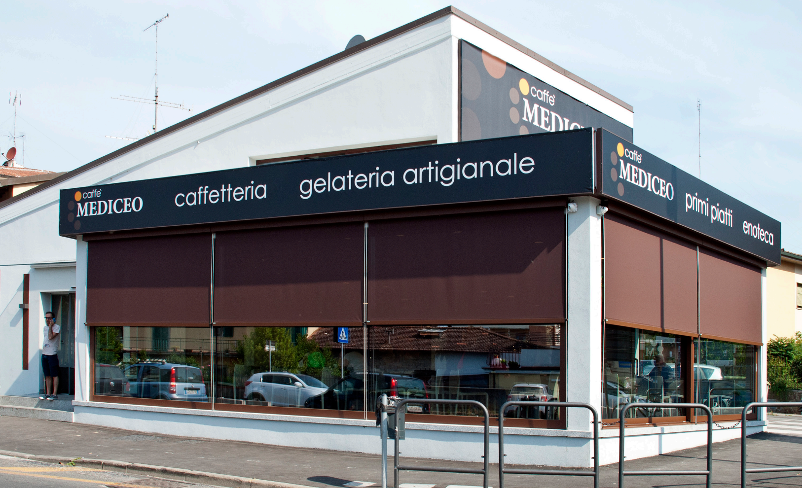
Caffè Mediceo, Borgo San Lorenzo, Florence Metra Systems, 65 HES e 150 STH HES