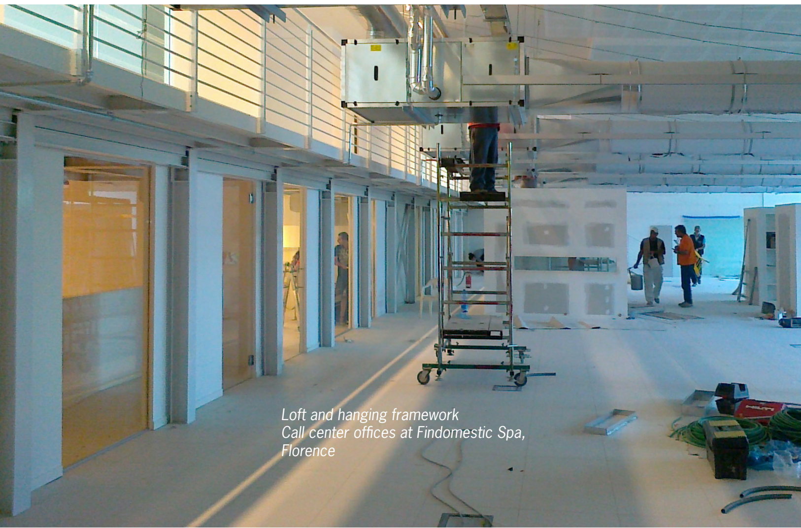
Loft and hanging framework Call center offices at Findomestic Spa, Florence