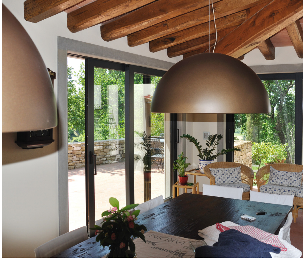
Private residence, Mugello, Florence Metra Systems, 150 STH