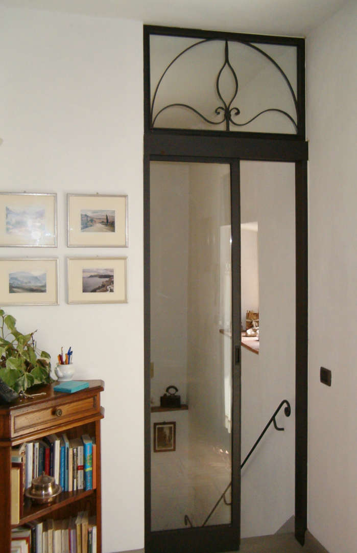
Private residences, Mugello, Florence Realization of bespoke project