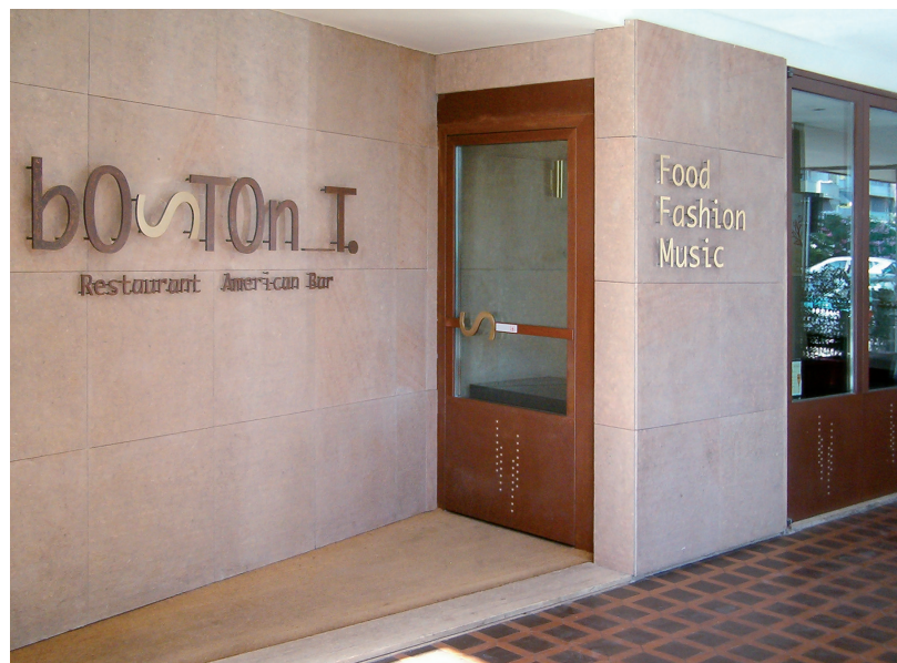
Florentine Night Club Corten Installation

Our iron window fixtures guarantee quality and durability combined with competitive prices and low maintenance costs.