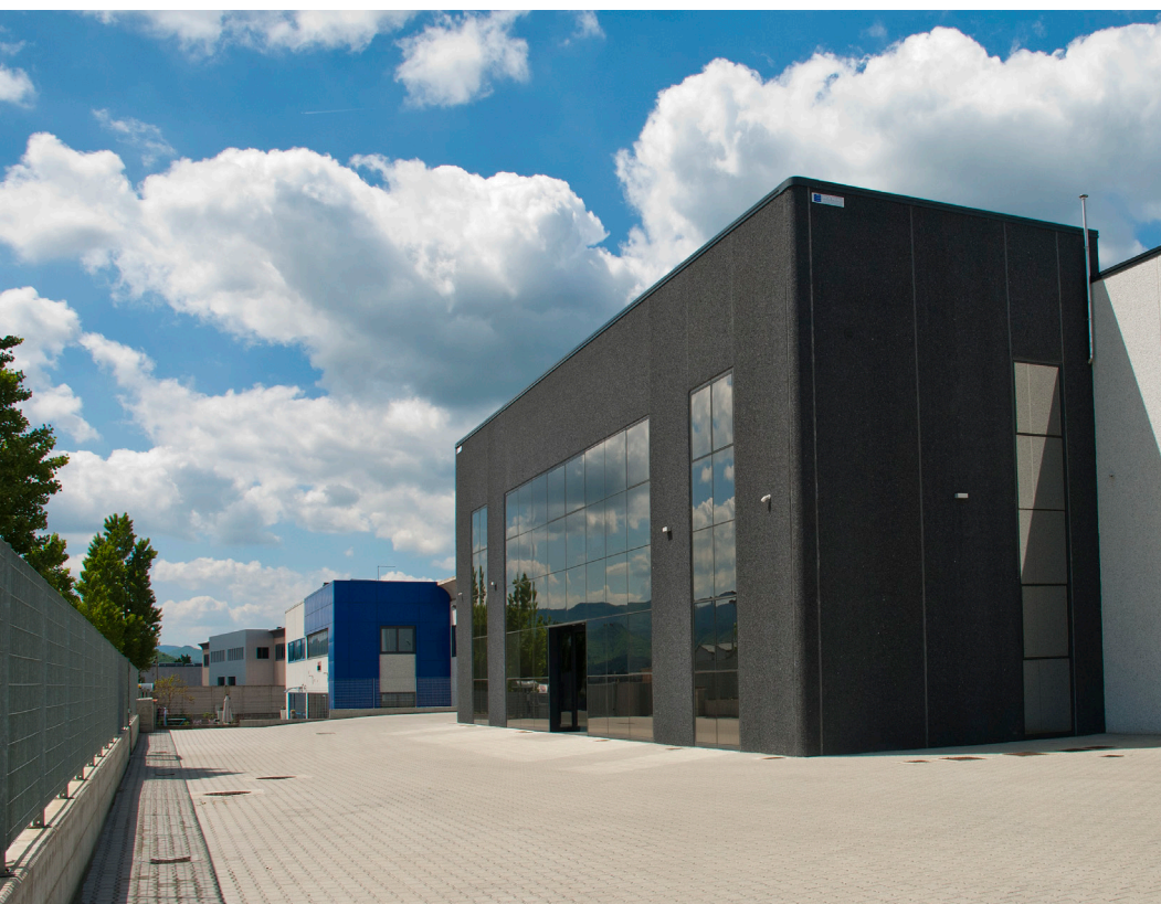
Galeotti Srl Automatic precision turning shop, Scarperia e S. Piero (Florence) Facade accomplished with Poliedra METRA Systems, SKY 50 CV, 65 STH