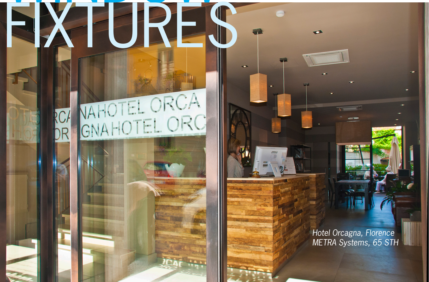
Hotel Orcagna, Florence METRA Systems, 65 STH