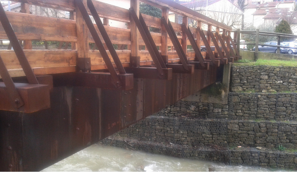
Bridge over the river Mugnoncello, Fiesole Corten plates installation