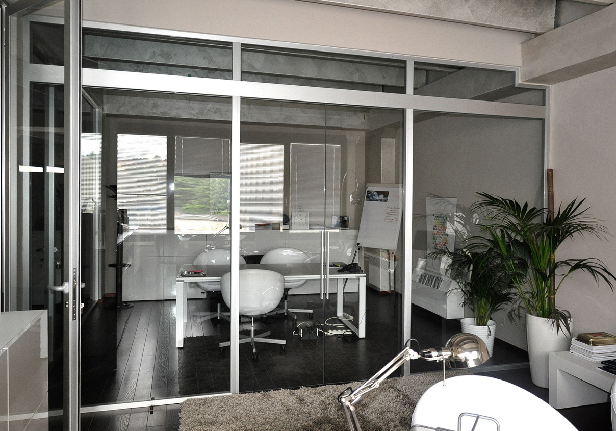
RIFLE srl offices, Barberino di Mugello, Florence Aluminium interior office walls